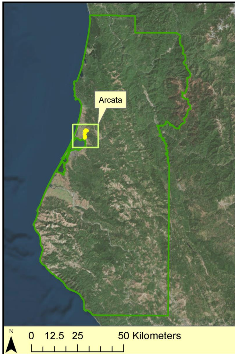
Figure 1. Analysis area within Humboldt County